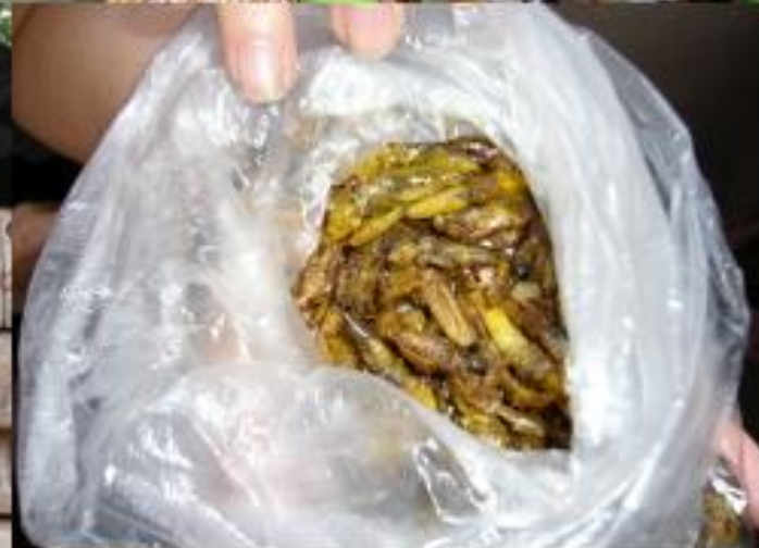
Fried Grasshoppers! Yummy!