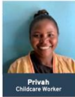
Privah Childcare Worker