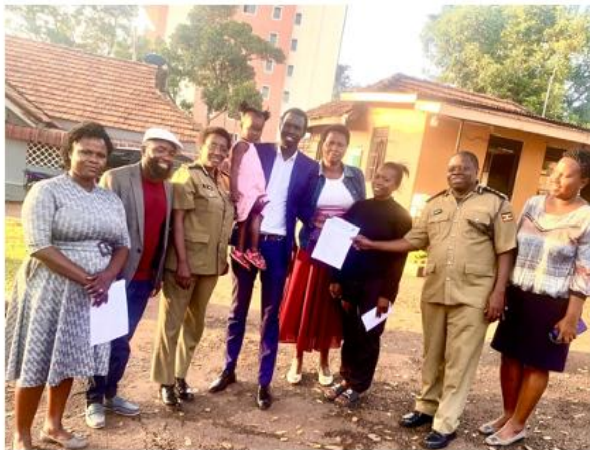
Police Family Child Protection Units (FCPU) - near the Children's Home handles roughly 20-30 cases a day